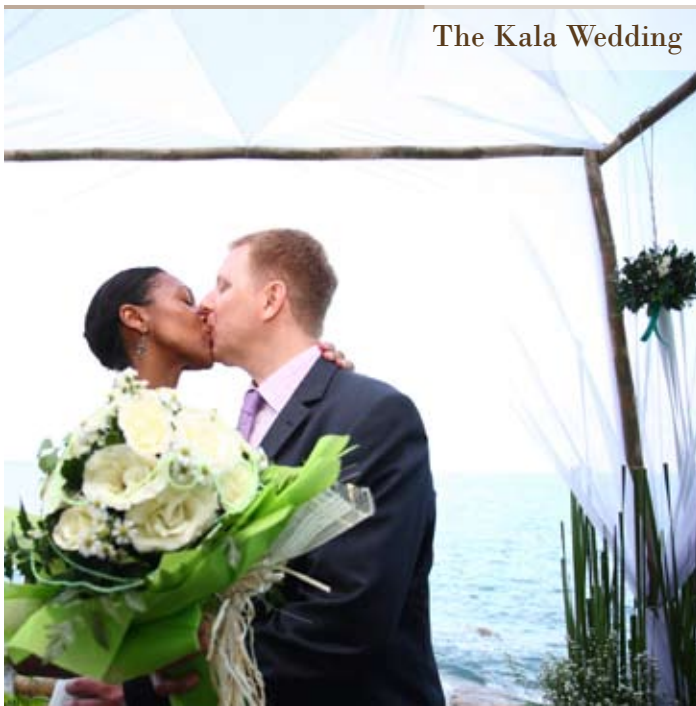
The Kala Wedding