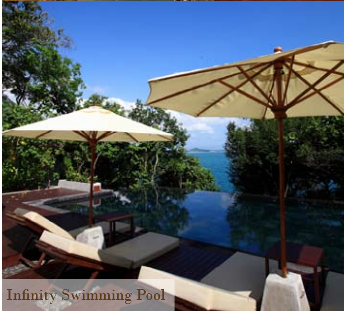
Infinity Swimming Pool