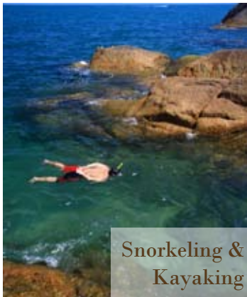
Snorkeling & Kayaking